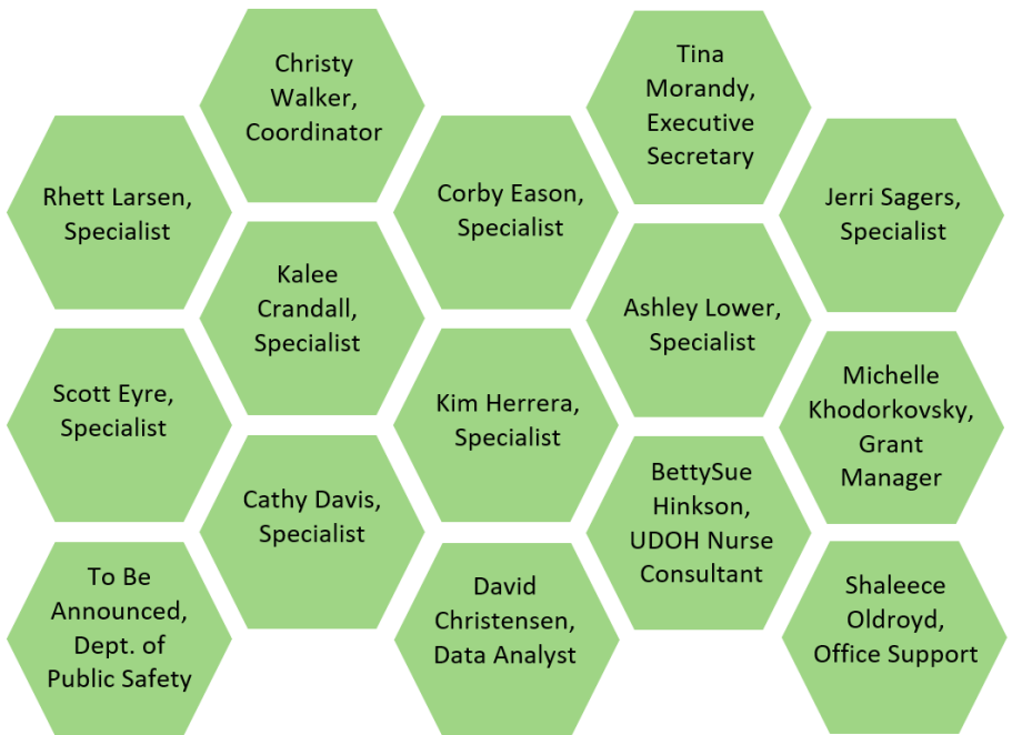
Figure 1. Safe and Healthy Schools Team

The Utah State Board of Education, in coordination with all stakeholders, has made Safe and Healthy Schools a board priority. It is one of the four goals of the Board’s strategic plan. To this end, the Board has created the Safe and Healthy Schools Team which is depicted in the figure below. One foundational step toward the development of the student support team pilot program is ensuring that key personnel are in place including the Safe and Healthy Schools Team (in Figure 1 below).