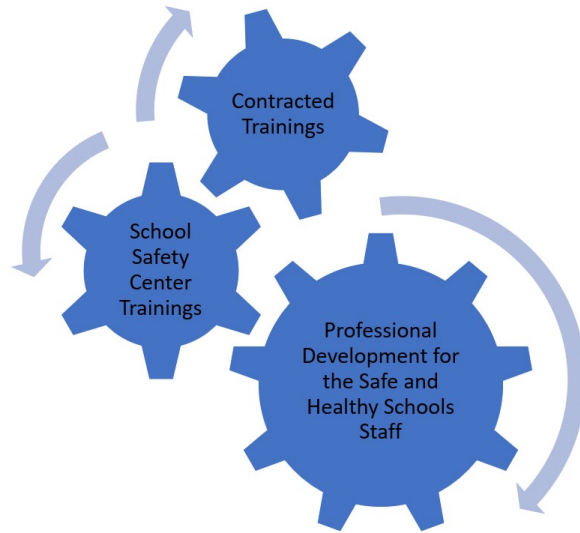
Figure 3. Development of Support Team Structures

Thus far, the contracted trainings included a one-day workshop on Comprehensive School Threat Assessment Guidelines (C-STAG) offered at the end of October 2019. This workshop covered the rationale for threat assessment, how the team functions, what steps to follow in conducting an assessment and resolving transient and substantive threats. In early November 2019, the Board offered a SIGMA Threat Management Training. SIGMA is a partnership of experts in behavioral threat assessment, threat management, and violence prevention. This training included how to build and operate multi-disciplinary teams, helping LEAs develop their own ability to assess and manage threatening situations in accordance with best practices.