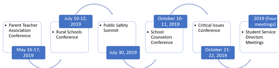
Figure 4. School Safety Center Trainings

Beginning in spring 2019, School Safety Center members began offering trainings at a number of events as detailed in Figure 4 below. These trainings included presentations on threat assessment basics, integrating mental health into school safety and threat assessment basics, and school-based mental health.