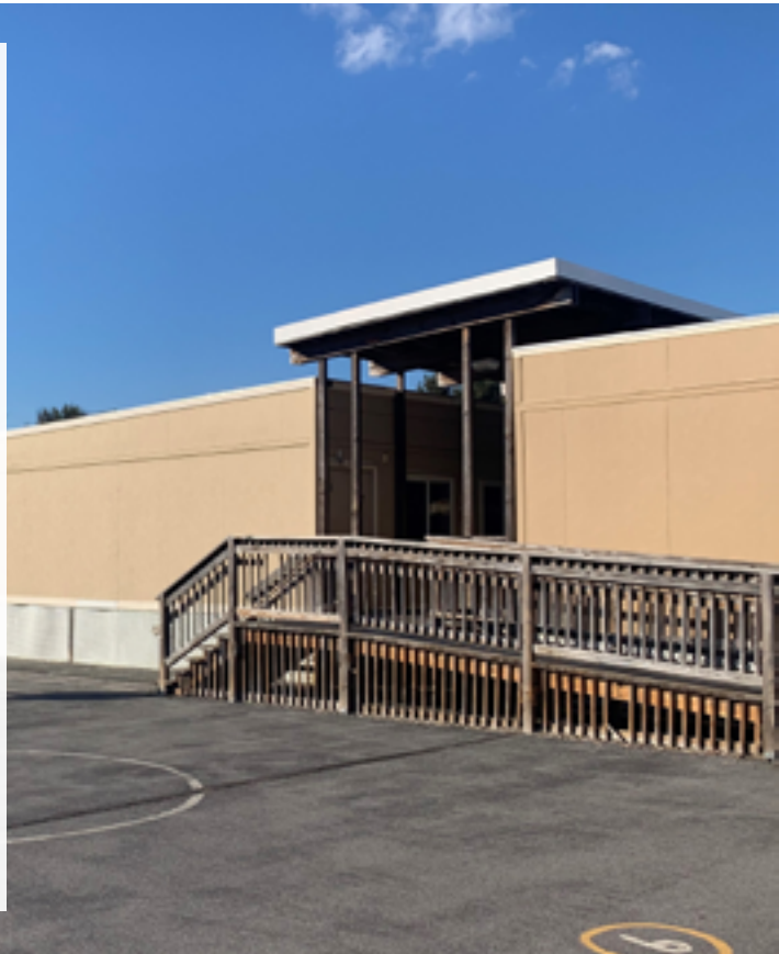
A TEMPORARY SCHOOL BUILDING IN MARYLAND.

Though the current school infrastructure funding gap is nearly $40 billion annually, the true cost is undoubtedly