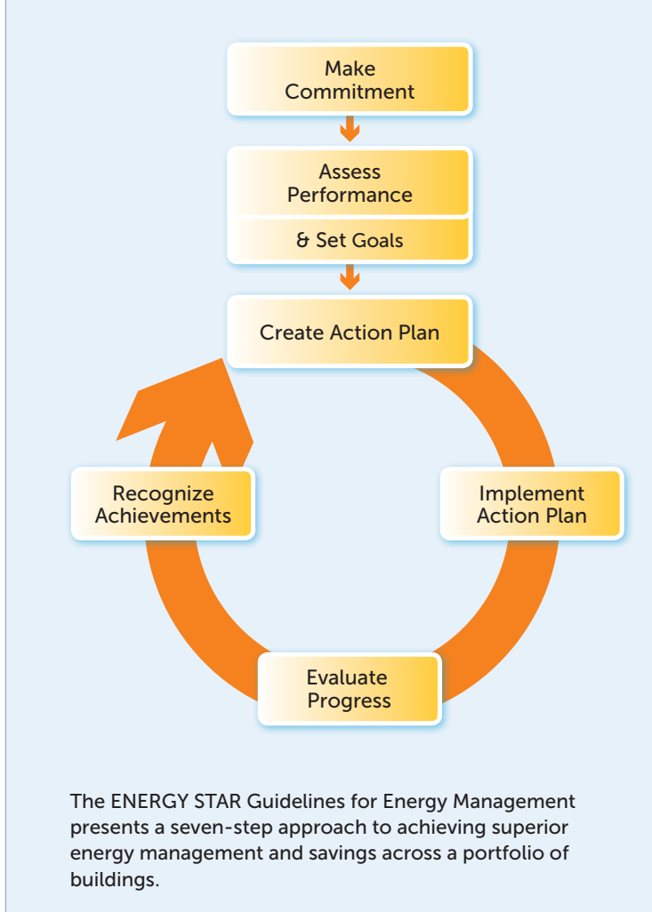
FIGURE 2 OVERVIEW OF ENERGY STAR GUIDELINES FOR ENERGY MANAGEMENT

For detailed descriptions of the above steps, see http://www.energystar.gov/index.cfm?c=guidelines. guidelines_index.