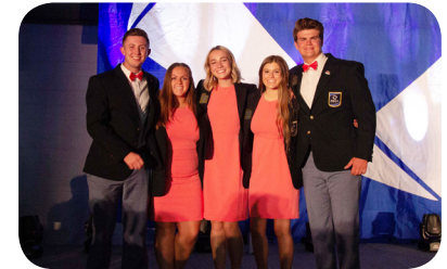
Utah DECA State Officer Team