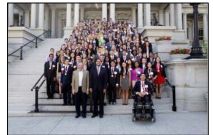
2017 U.S. Presidential Scholars