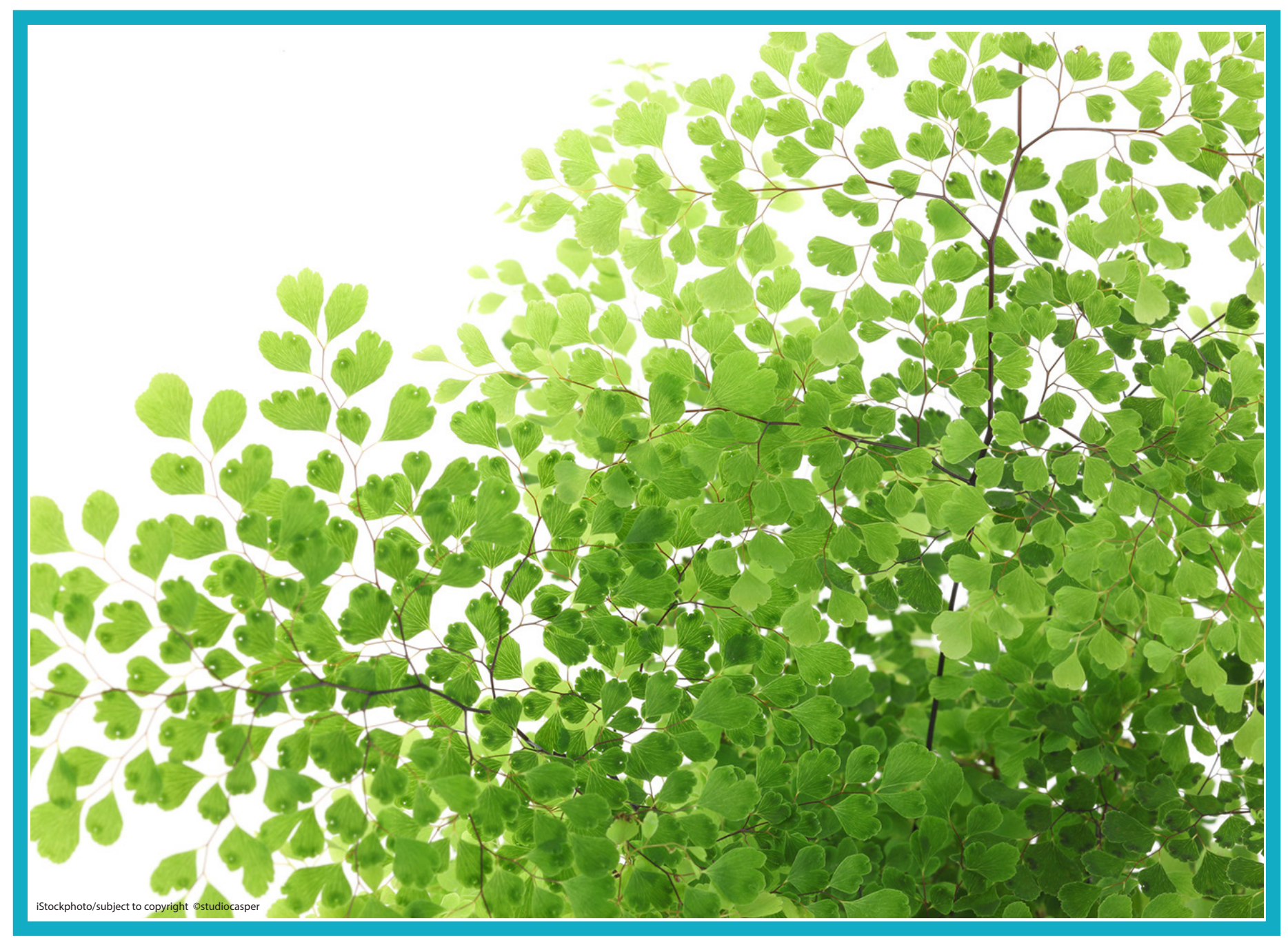
Page 7 QUESTION #7