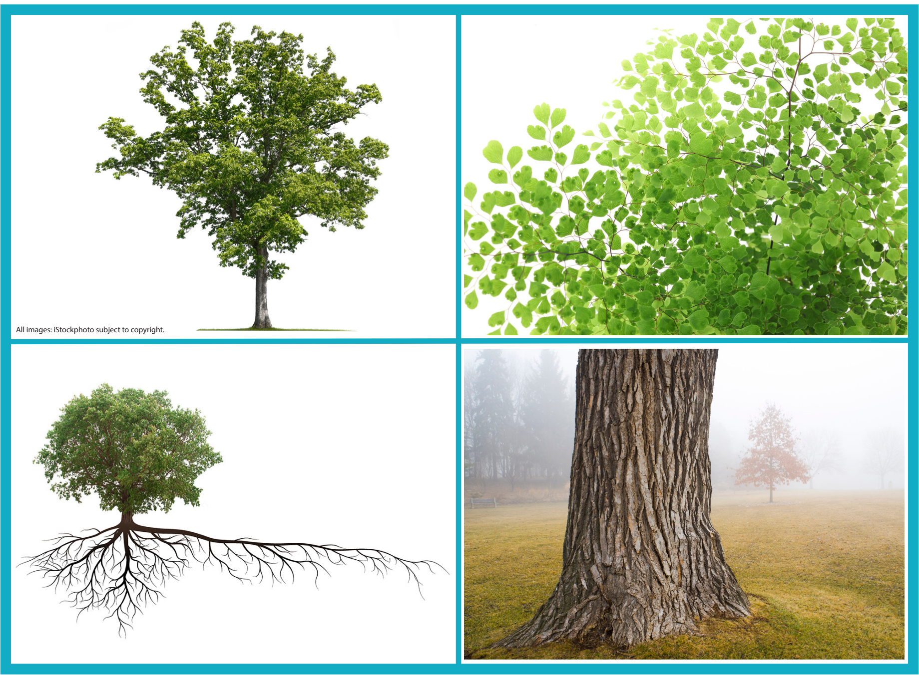
Page 13 QUESTION #7