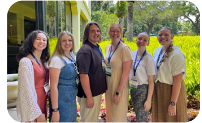
Educators Rising Utah State Officers

At the annual Educators Rising National Conference students, from across the country, compete for national titles in more than 20 competitive events.