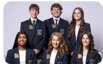
Utah DECA State Officer Team