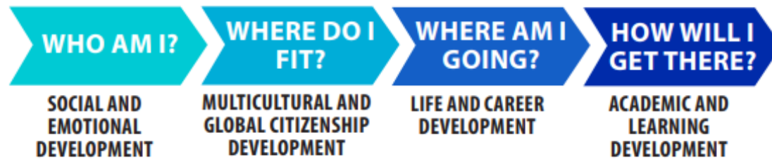
Figure 3: Utah College and Career Readiness Student Mindsets and Competencies

From a systemic approach, it is important that the student mindsets and competencies are embedded deep within the system. The term Collaborative Classroom Instruction represents the importance of working collaboratively with teachers to ensure that the student mindsets and competencies are embedded in instructional content and reinforced in multiple settings. Therefore, it is considered best practice for the teacher to attend the school counselor’s lessons with their students. This allows the teacher to use the information to reinforce, solidify, enhance, and embed the lessons learned into their curriculum.