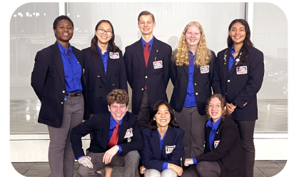
Utah TSA State Officer Team

TSA members are challenged to use and improve their STEM skills in both team and individual competitive events—locally and nationally.